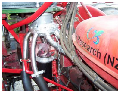
After – note slide for dropping motor away from distributor housing to change slip rings easily.