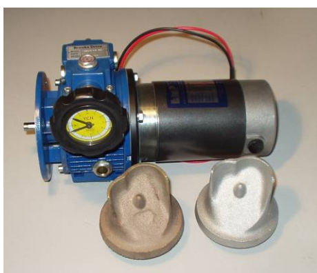
Plate 5. Flexiseeder Brooks-S&N mechanical vari-speed module including two impellor blocks, one cast in bronze and the other aluminium.

Recommended operating speeds for impellers of this type vary between; 600 rpm for big beans, 750 rpm for soya and peas and 900 rpm for grain, oilseeds, etc. Fertilizer requires at least 900 rpm. Therefore ranges of working speeds are required between 500 and 1500 rpm or at some fixed speeds 600/750/900/1050/1200. These impellor speeds cannot be obtained using the above modification. The project is therefore working with John Brooks Ltd to develop and promote an alternative 12 / 24 volt drive of 180 / 250 watt and 1500 and 2000 rpm capacity coupled with an in-line mechanical variator (see Fraser et.al. 2008 and Plate 5).