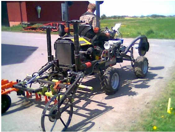
Plate 3. MacTrac ( www.mactrac.se ) use of Flexiseeder - Smallaire module on its new prototype modular plot seeder, under construction.

Good progress made in Norway during 2007 for up-grading their air delivery system prompted Sweden to adopt the same system for its MacTrac project. The object of the Swedish project is to make a drill module for the MacTrac tool carrier. It is a co-project between the Applied Field Research group at the Swedish University of Agricultural Sciences (SLU), Mapro Systems AB (producer of MacTrac) and the Agricultural Society of Halland (user of the drill). The main part of the component costs are paid by the end user while SLU and Mapro have taken development costs. Besides the Flexiseeder – Smallaire module, portion feeder, digital drive, and tool bar / tyne / tip modules are being used from the New