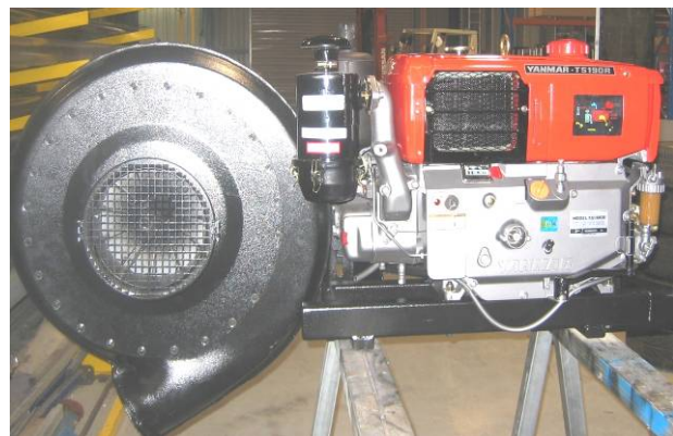
Plate 3. Example of the efficiency and performance of one of Smalle's custom designed blowers (22 series turbo 4500 rpm).