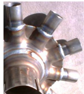
Norway Flexi-Plot Machine – modified distributor insert (Norway Cone), manometer