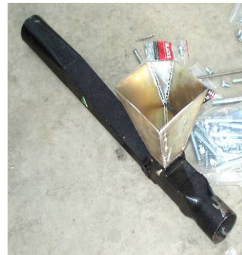
Smallaire components including venturii ( lower right) – note slim line of blower on plot machine – centre top blower has 150 mm outlet while the others have 75 mm outlets