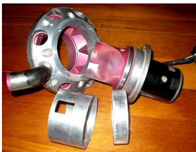
Before – note slip ring insert for altering number of rows sown

At the same time as the Flexiseeder – Smallaire module was being evaluated and up-graded, after-market modifications were being made in Christchurch, to a “Farmall” plot seeder built locally seven years ago. It included a locally manufactured Oyjord-type mechanical distributor. The distributor was powered by a 1/8 hp, 12 volt electric motor of the type used in car heaters. While operating adequately for small- and medium-sized seeds and small plots, it proved unreliable for larger seeds and longer plots (20 m). The motor was under powered. It ran at 2,800 RPM while not under load, but lacked torque to maintain speed settings under load. It was replaced with a modified ¼ hp vehicle generator (dynamo) used as a motor, direct coupled to an inverse fabrication of the traditional Oyjord impellor. Powered in this way, at full speed, the distributor ran at 800 rpm. Six settings were built into a control system, equally spaced between 400 and 800 RPM using a resistor.