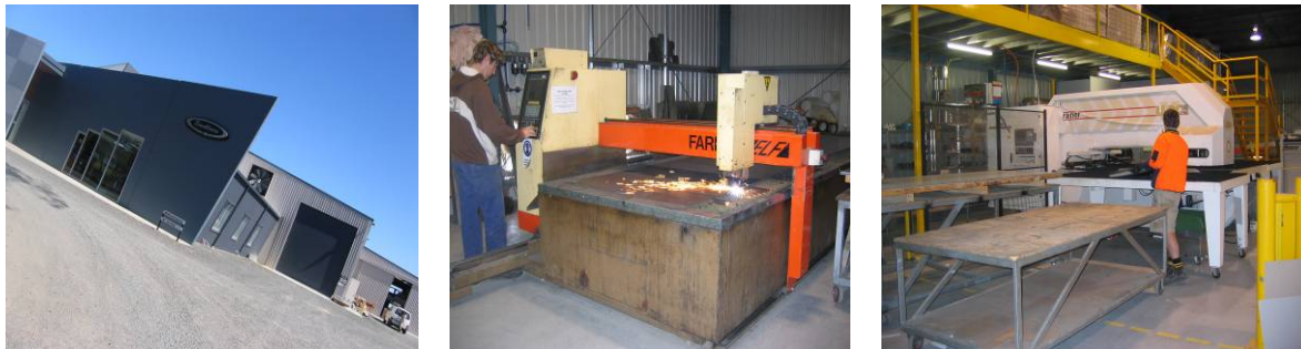
Plate 1. Photo-composite of Smallaire factory and key facilities.

ventures, primary heads, secondary heads, splitters, blowers, riser pipes plus a range of other components and accessories. They also custom make practically any thing to do with air assisted farm machinery. A photo-composite of the factory is presented in Plate 1.