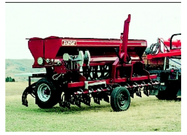
Fig. 8. Double box drill (Model 360 MD) fitted with end-tow (farmer version).