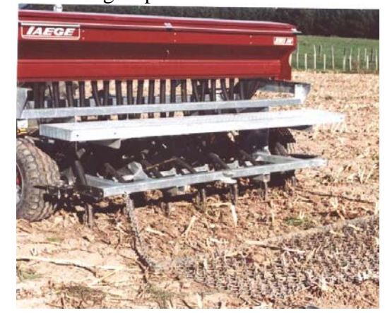
Fig 6. Single box drill (Model 300 MS) working after arable forage maize.