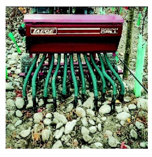
Fig. 4. Mini drill direct seeding into stoney ground between grape vines.