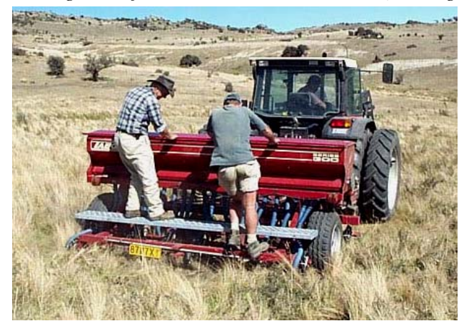
Fig. 7. Single box drill (Model 300 MS) working in tussock country.