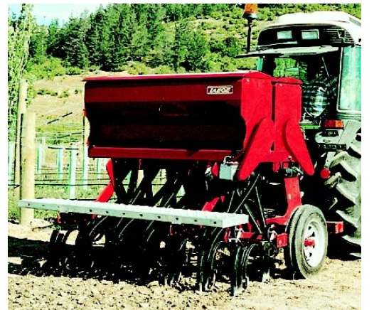
Fig. 5. Vineyard / Plot drill (Model 1.4 ED) direct seeding. "Knife–like" boot shown as insert (B. Taege).

Early in 2004, a two page questionnaire plus covering letter was mailed to 250 owners / operators of drills fitted with offset 12mm cultivator types, inviting them to comment on their experiences, and to offer their suggestions for improvement. Forty-six questionnaires were completed and returned; at least one from all major agro-ecologies / management systems in New Zealand where the drills were known to be operating. Follow-up phone calls and several farm visits were made. The data obtained have been combined with field experience gained over the past four years by the manufacturer, dealers and the authors. Between 2001 and early 2004 the senior author travelled more than 85,000 km throughout the length and breadth of New Zealand working with dealers, farmers and other users while delivering and starting drills and forming and developing informal farmer discussion groups.