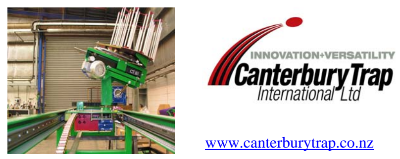
Plate 1. Olympic skeet launcher from which integrated motion control technologies were extended into the Flexiseeder project.

coming Olympics in Bejing), 15 of these simple traps would have been required for each bunker layout. Instead, one multi-purpose trap machine with combined position control to tilt, yaw and also reposition in the traverse plane, replaced the traditional 15 trap layout. This new system is programmable to emulate the nine different ISSF tables for height and angle as described in the international rule book. The system has a design registration and patent pending. John Brooks Ltd was therefore invited to join the Flexiseeder project. It was from this background that the Brooks – S&N electronic gearbox originated as a cross-over design using integrated motion control