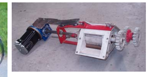
Encoder mounted top left behind steel protector

"Brooks Drive" Worm Gearbox and mounting torque arm fitted to base of S&N Flexiseeder cell wheel assembly<sup>10</sup>.