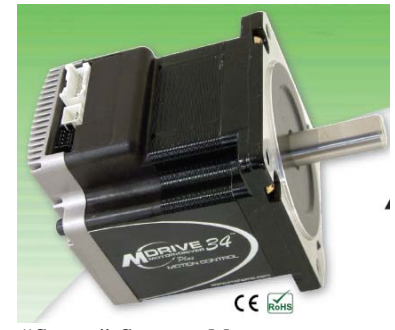
"Smart" Stepper Motor www.mdriveplus.com